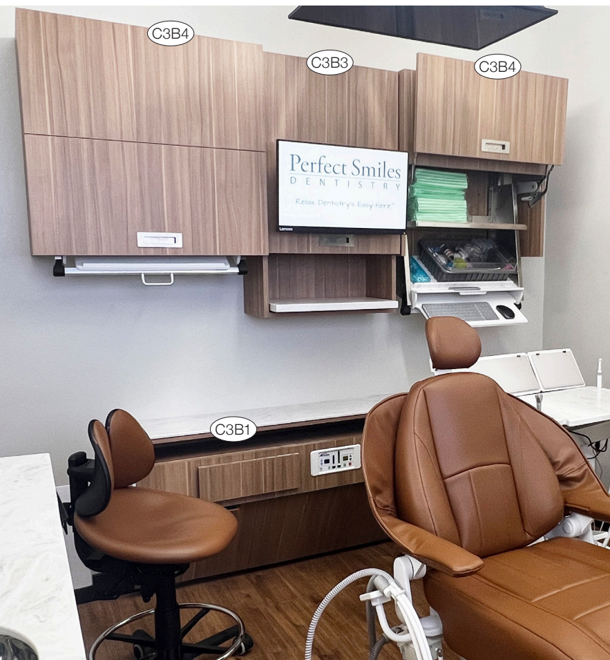
Shown with options, including nitrous cutout & panel. Call for details. Monitor not included.

A stylish look with enhanced efficiency – especially for surgical operatories with space constraints.