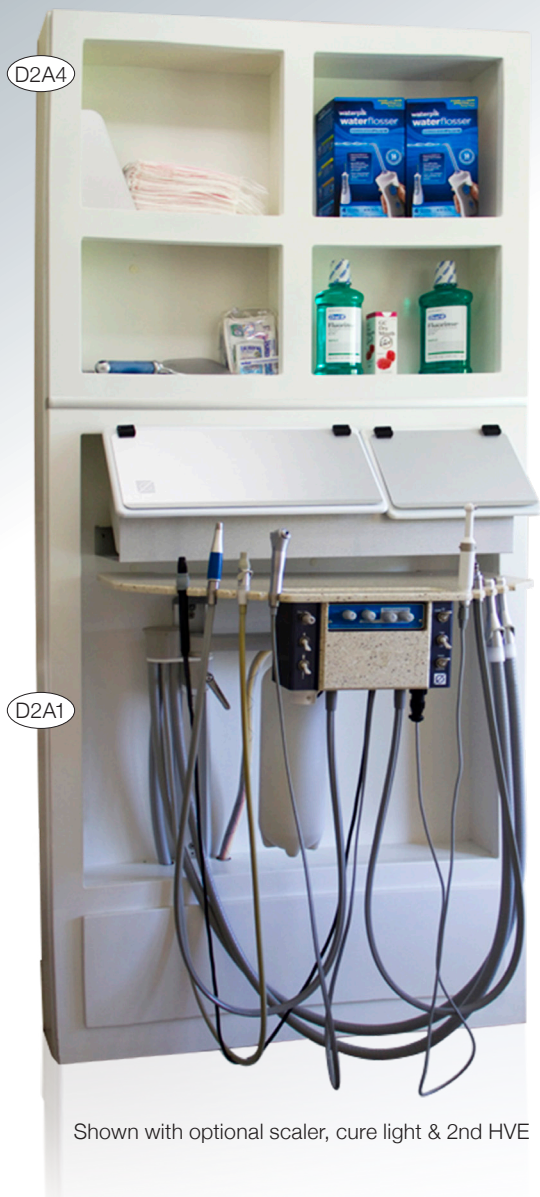
Shown with optional scaler, cure light & 2nd HVE

A compact InWall all-in-one instrument that provides Hygiene the same high-level production capabilities found in all our Workstations.