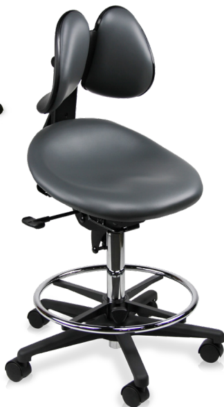
Asst. Stool (item S2A2)