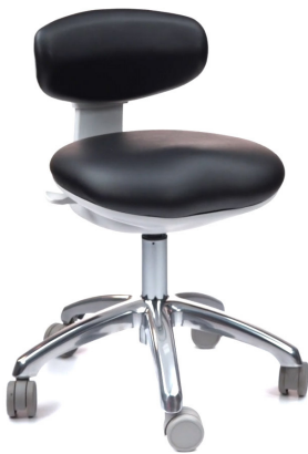
Dr./Hyg. Stool (item S2B1)