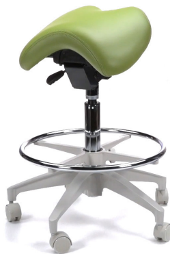
Asst. Stool (item S2B4)