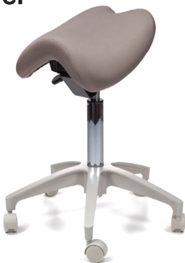
Dr./Hyg. Stool (item S2B3)