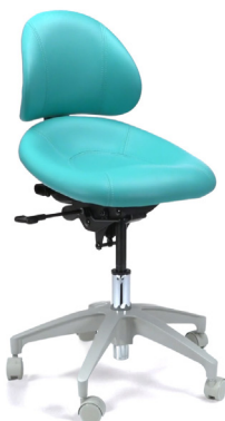
Dr./Hyg. Stool (item S2B5)