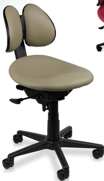
Dr./Hyg. Stool (item S2A1)

The patented design of the RGP 400 line helps protect your most important asset: your health.