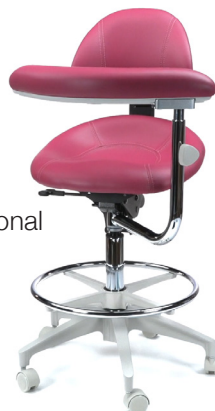
Asst. Stool (item S2B6)