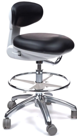
Asst. Stool (item S2B2)