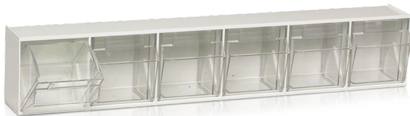
6-Bin Unit (item M1F2)