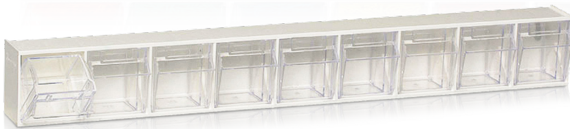
9-Bin Unit (item M1F1)